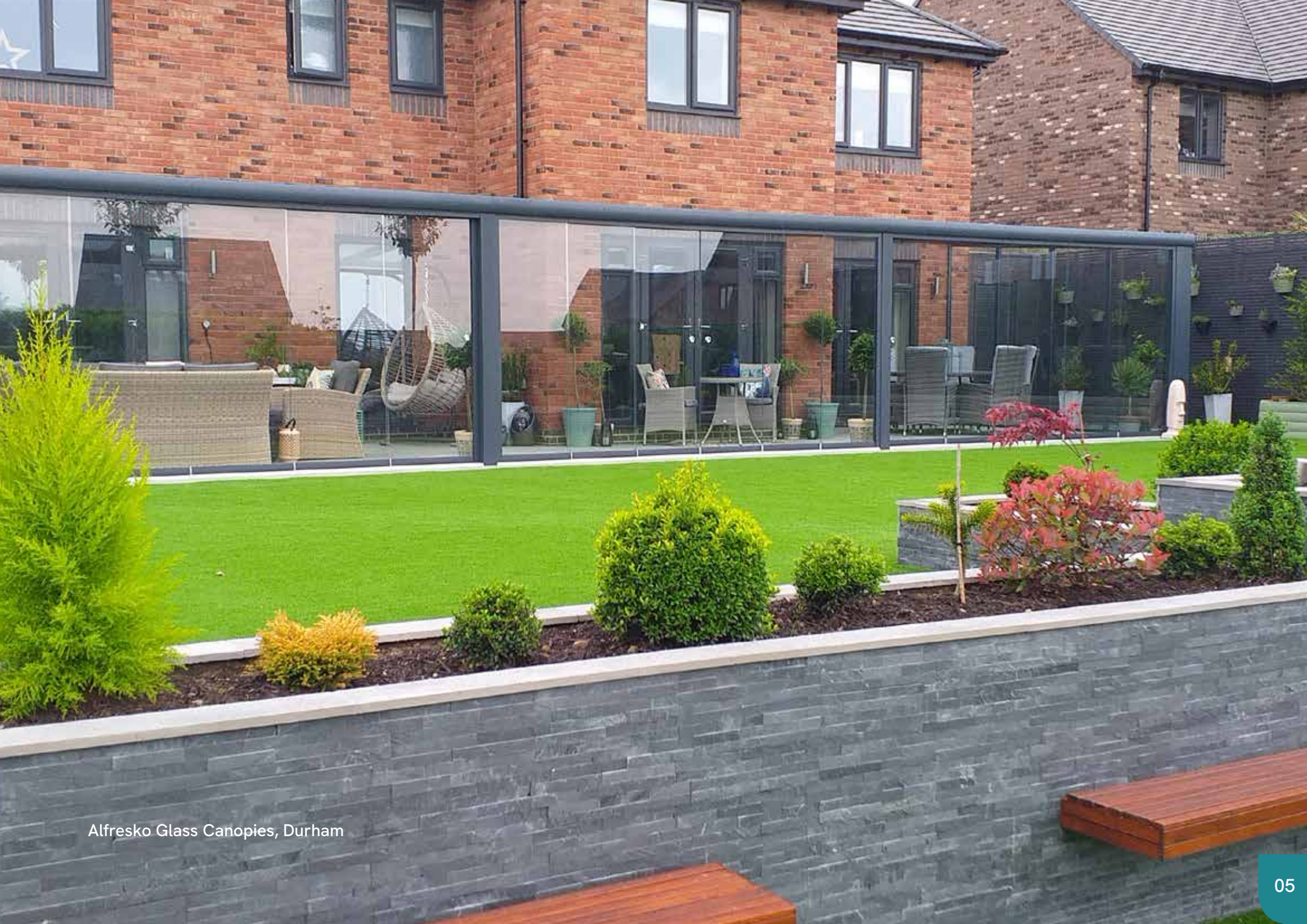
Alfresco Glass Canopies, Durham